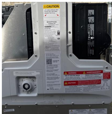
Installed Enphase Battery Placard