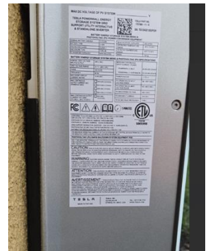
Tesla Battery/Inverter Serial Number