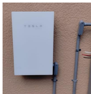
Installed Tesla Battery / Inverter