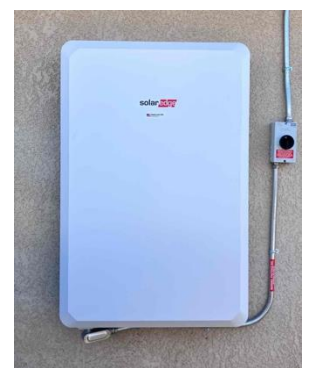
Installed SolarEdge Battery