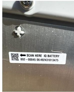
Enphase Battery Serial Number